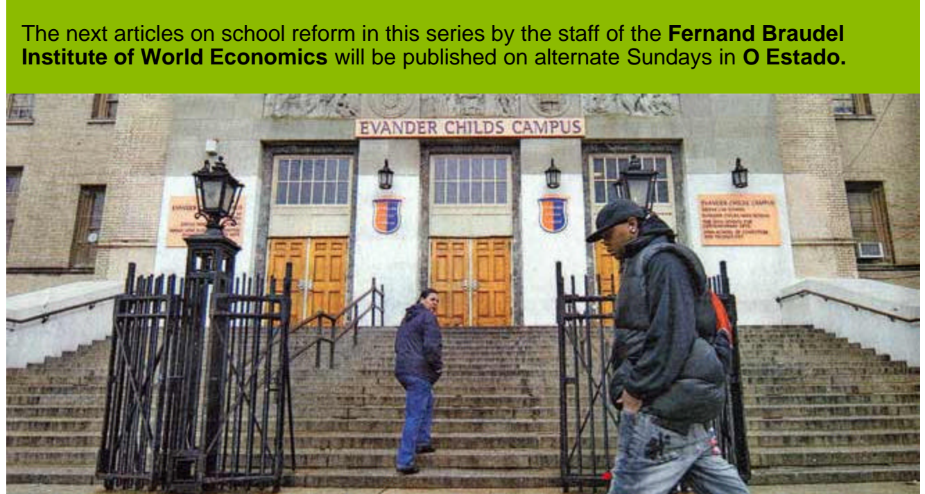
Ex-Problem - My old school, Evander Child High School, in the Bronx, was an "impact school', getting the attention of specialists in public security, the police, and school safety local agents to reduce violence and disorder.